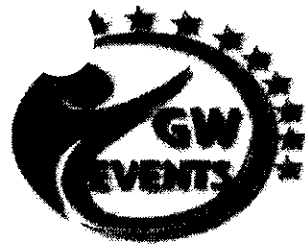
EXHIBIT A Proposal